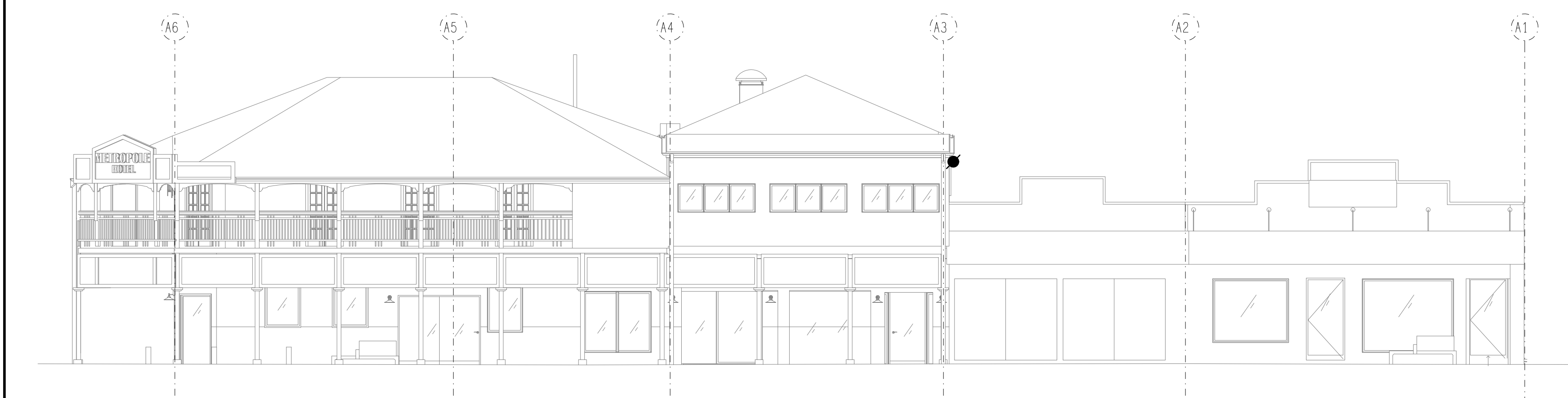
MAIN STREET EXTERNAL BUILDING ELEVATION SCALE 1: 100